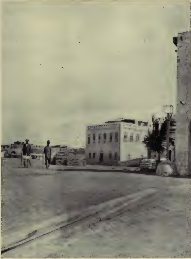
GENERAL GORDON'S HOUSE AT ZEILA.